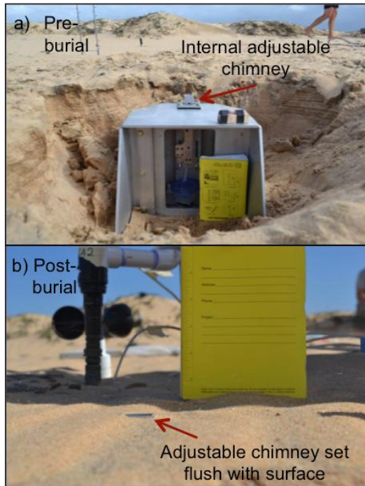
Figure 2: Diagram showing the deployment of the Swann and Sherman (2013) bedload trap: a) pre-burial showing the outer housing case, internal adjustable chimney and bedload collection vessel, and b) post-burial of trap showing the adjustable chimney aperture set flush with the surface.

The most essential requirement for capturing bedload particles is for the sampling aperture to remain flush with the surface. This is can be challenging as the height of the surface changes with increased transport. An adjustable chimney accommodates changes in surface height (e.g. ripple migration), Figure 2.