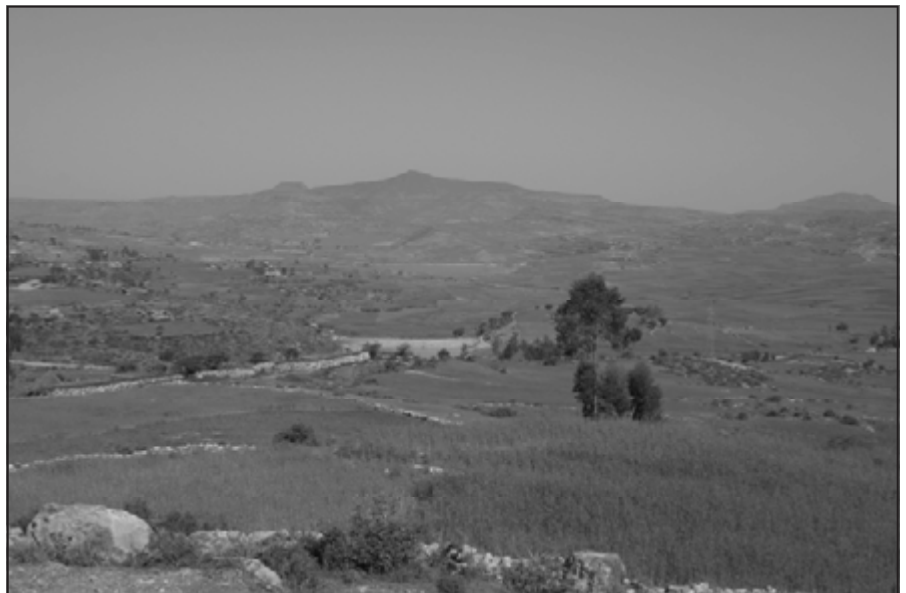
Stone bunds and small farm dams constructed in recent years to control soil erosion and to provide water for irrigated crops

After a day in the lecture hall it was good to get out into the field (especially for those of us new to Tigray) and see some of the things we'd heard about, and some new things as well. The two field days had presentations on all three themes and, for logistical purposes, it was not possible to keep the three separate, but that is under-