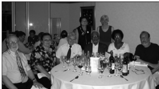
The symposium banquet following a tour of the Research Vessel RRS Discovery in Dundee

The IAHS awards at the end – not sure if they were created by the local organisers or whether they are a