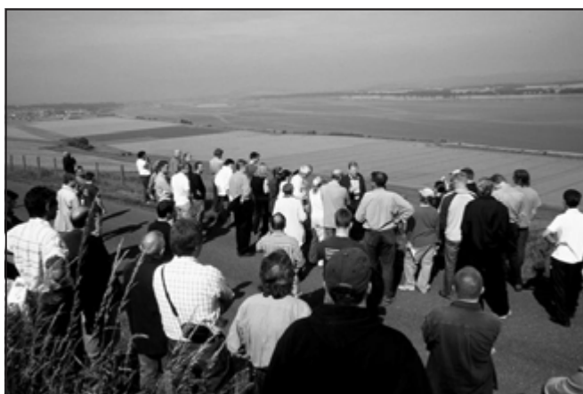
Delegates viewing the upper reaches of the Tay Estuary looking northwards into Perthshire

certainly worth replicating. Second, the structure fostered a steady flow of engaging discussions, rigorous questions and salient comments throughout the week. I think this was due to a good mixture of well-subscribed, fun social activities and a field trip interspersed amongst the papers. Lastly, the small size and interactive nature of the conference (in sessions as well as at the bar) made for a stimulating week.