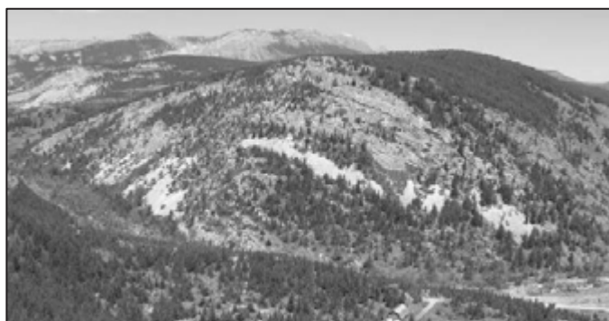
A view of the Teton Anticline, looking NW into the hinterland of the thrust belt.

Fieldwork in the Sawtooth Range, Montana, in summer 2006, forms part of a programme investigating the deformation rate and styles of development of fold types in fold-thrust belts. This complements earlier use of geomorphological attributes interpreted from satellite images to study the development of folds in the Zagros. Folds developed in similar lithologies and in similar structural settings were examined in both mountain belts.